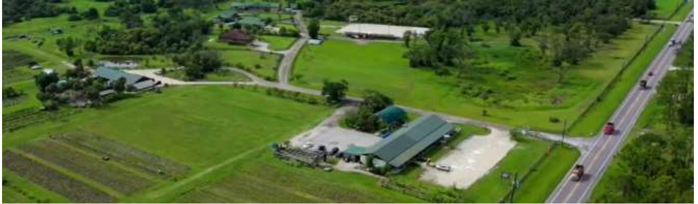
Recent drone view of Greenwell property

The representative immediately announced that Greenwell was willing to drop the maximum height of the buildings from 60 feet to 45 feet, as if that were the main point of contention. The commissioners then approved the rezoning 3-1.