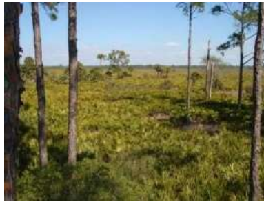
Alva Scrub Preserve