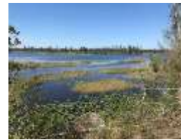
Frank Mann Preserve