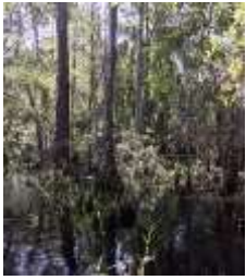
Bob Janes Preserve