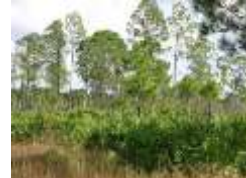
Telegraph Creek Preserve