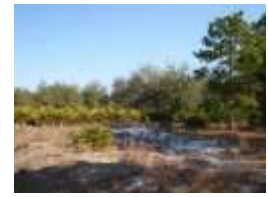
Buckingham Trails Preserve