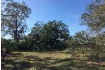
Olga Shores Preserve