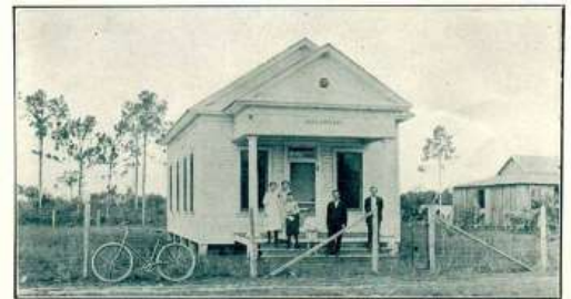
Public Library, Alva

The Alva Library Museum 21420 Pearl St, Alva, FL 33920