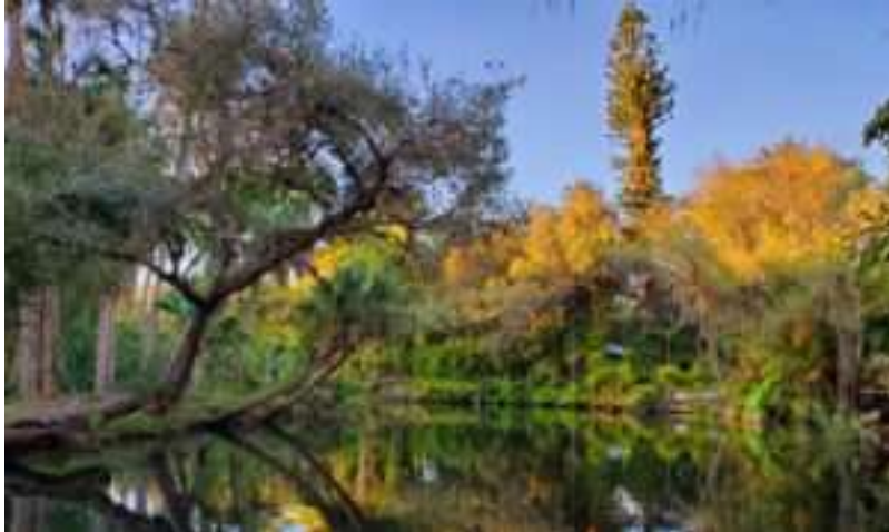
Caloosahatchee River Bend, OXBOW, near Alva