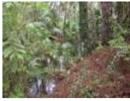
Daniel's Preserve at Spanish Creek